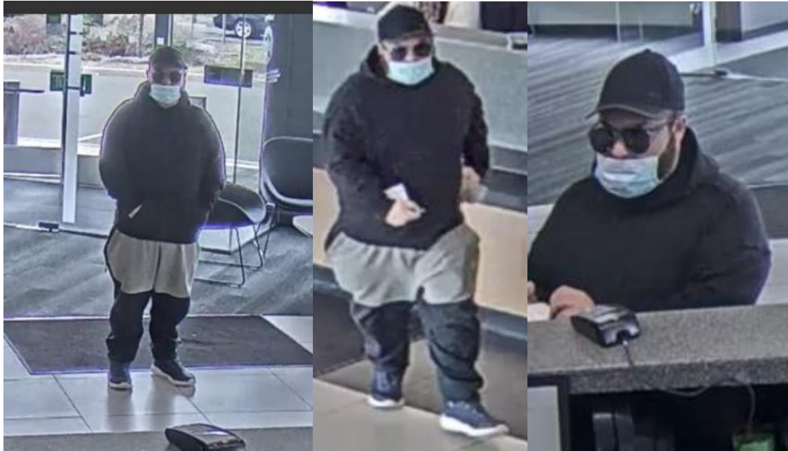
Surveillance stills from TD Bank